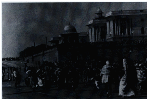
A view of the Republic Day Parade held in New Delhi several years ago.

Information on registration, housing, and travel is available from the AOCS, 508 S. Sixth St., Champaign, IL 61820 (217-359-2344).